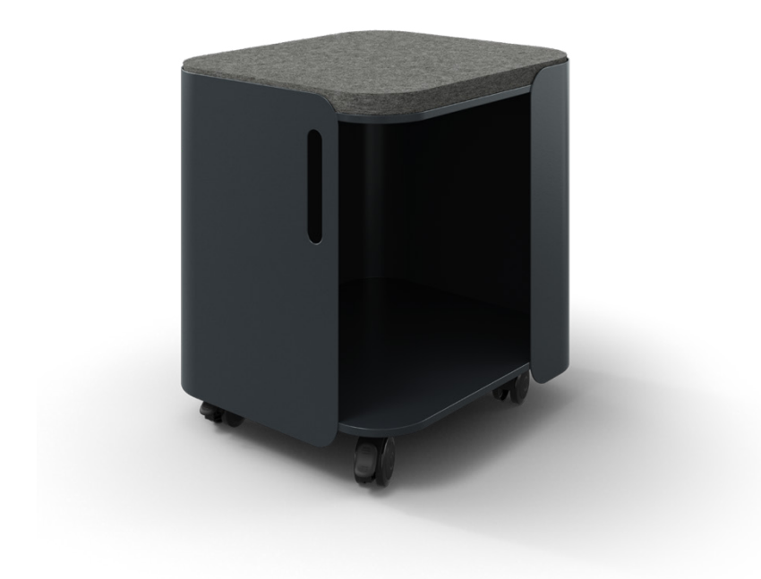
Cart - Grey 3202-STAS-00FPC