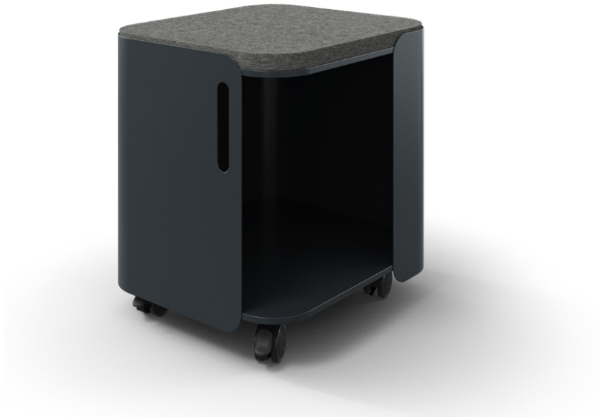
Cart - Grey 3202-STAS-00FPC