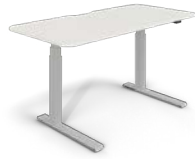
Perfect White Worktop Grey Silver Table Base