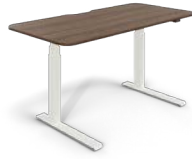
Walnut Worktop Perfect White Table Base