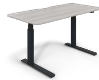
Grey Elm Worktop Graphite Table Base