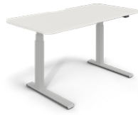
Perfect White Worktop Grey Silver Table Base