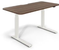
Walnut Worktop Perfect White Table Base